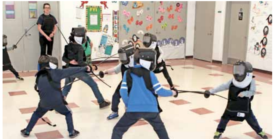
Fencing has become a popular instructional class at the Recreation Center.

The Spring Program schedule begins on April 9th. We offer a wide variety of activities including Babysitting, Kids in the Kitchen, CrossFit Kids, Happy Piano, as well as instruction in Swimming, Tae Kwon Do, Guitar, Tennis and Fencing. Classes for little ones include Music for Infants and Toddlers, Tumble-Time, Parent-Toddler Workshop, and Kinder-Crafts. Gymnasts will begin practicing for the annual Gymnastics Shows on June 1st, 2nd, and 3rd.