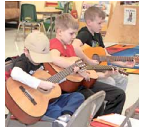
Guitar lessons are just one of the many activities offered in the spring session, which begins on April 9th.