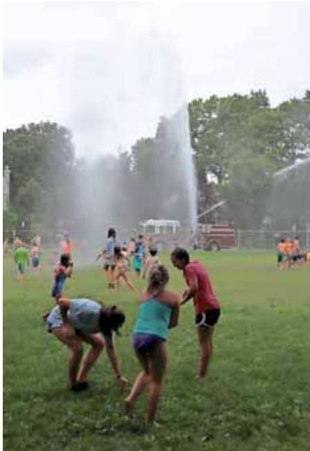
Fire truck sprinkler day is one of the highlights of Summer Playground.