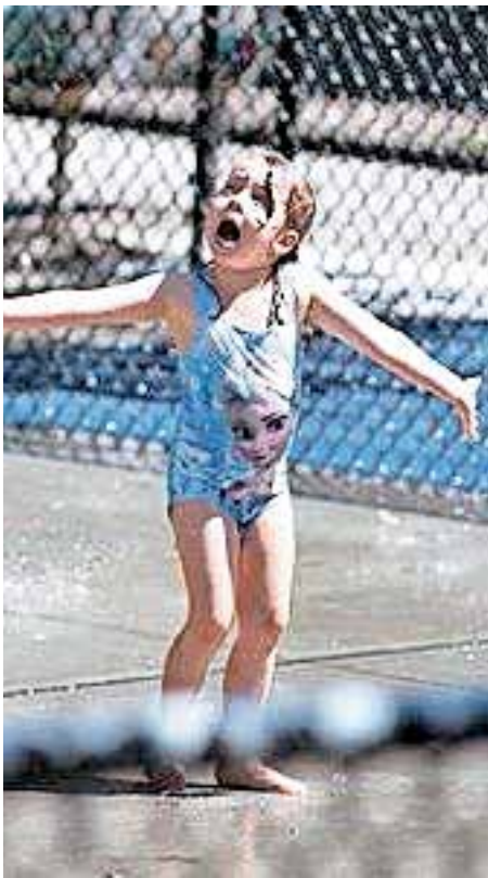
The playground with splash park will re-open this Spring, as soon as Mother Nature cooperates.

DETAILED INFORMATION FOR ALL ACTIVITIES CAN BE FOUND AT THE RECREATION CENTER OFFICE OR ON THE RECREATION CENTER WEBSITE AT WWW.RVCREC.WEBLY.COM